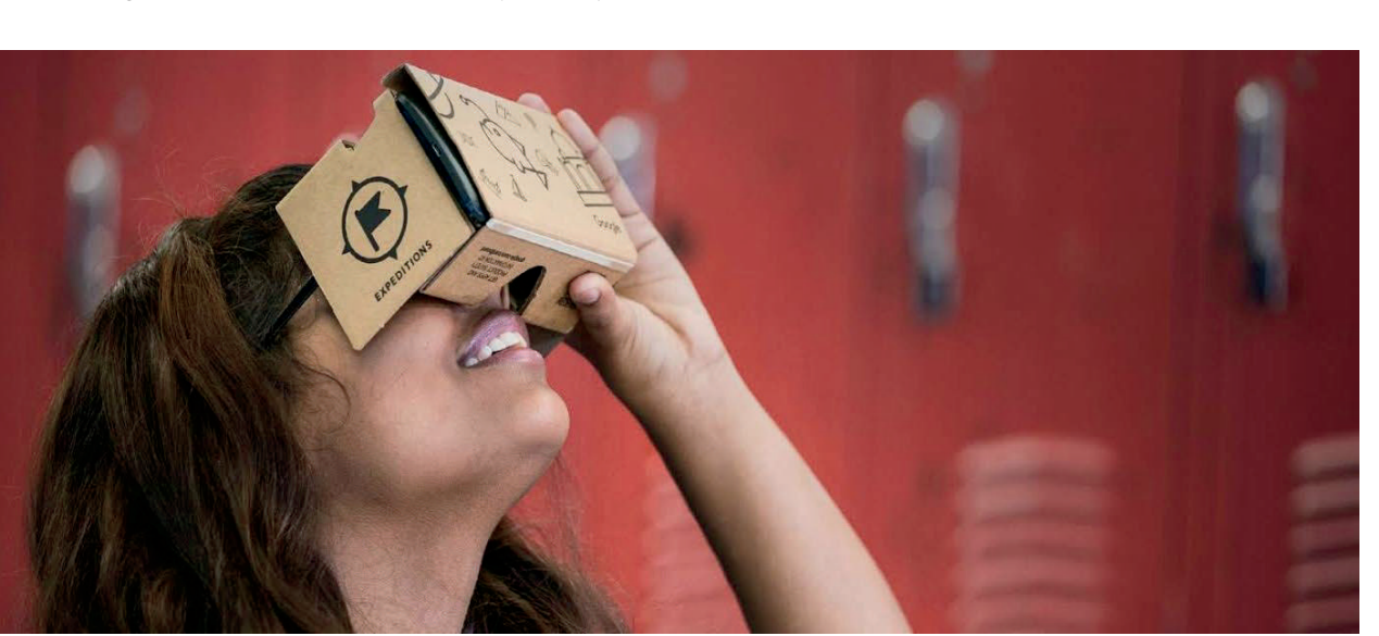
Expeditions Pioneer Program kits include Cardboard viewers with Android phones for 3-D virtual reality viewing.