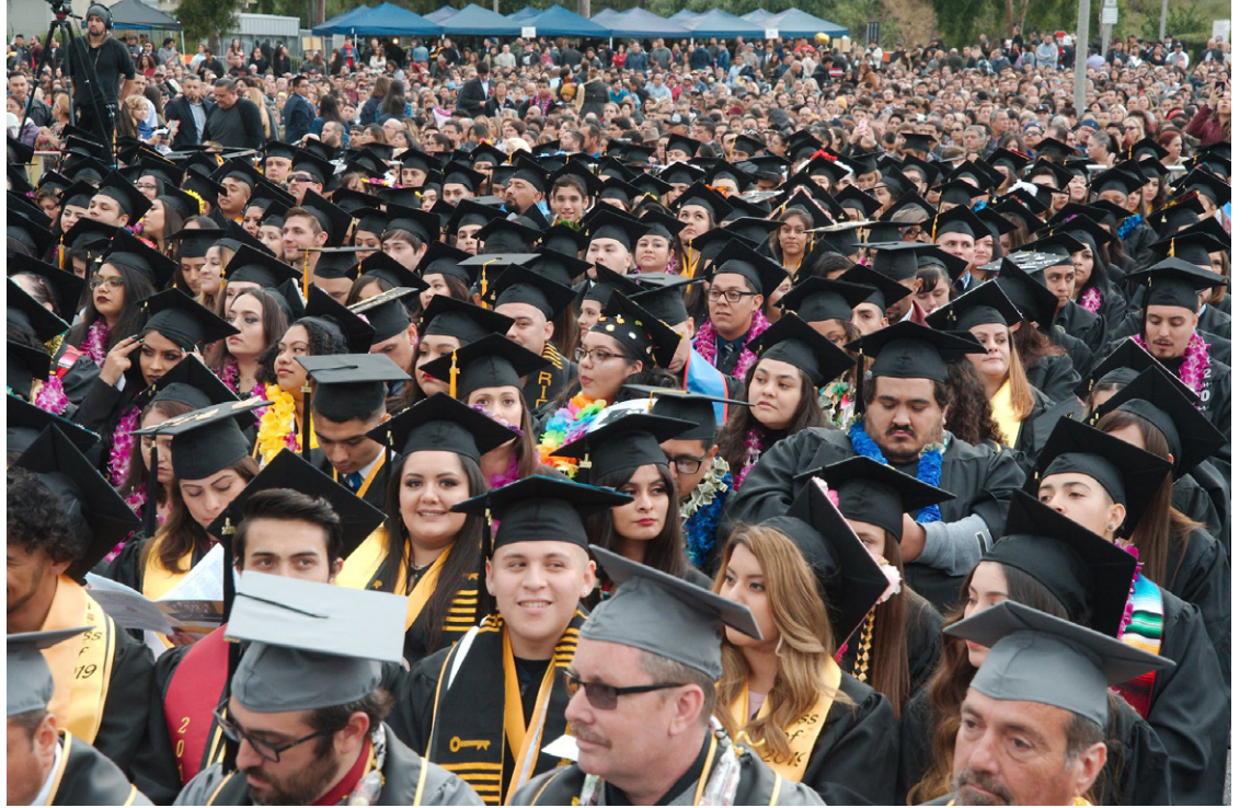
▲ Rio Hondo College Celebrates Class of 2019; Awards Historic First Bachelor of Science Degrees

The California Community Colleges bachelor's degree pilot program began in 2014 and was established to make it easier and more affordable for students to get their bachelor's degree.