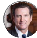
Governor GAVIN NEWSOM