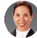
Lieutenant Governor ELENI KOUNALAKIS