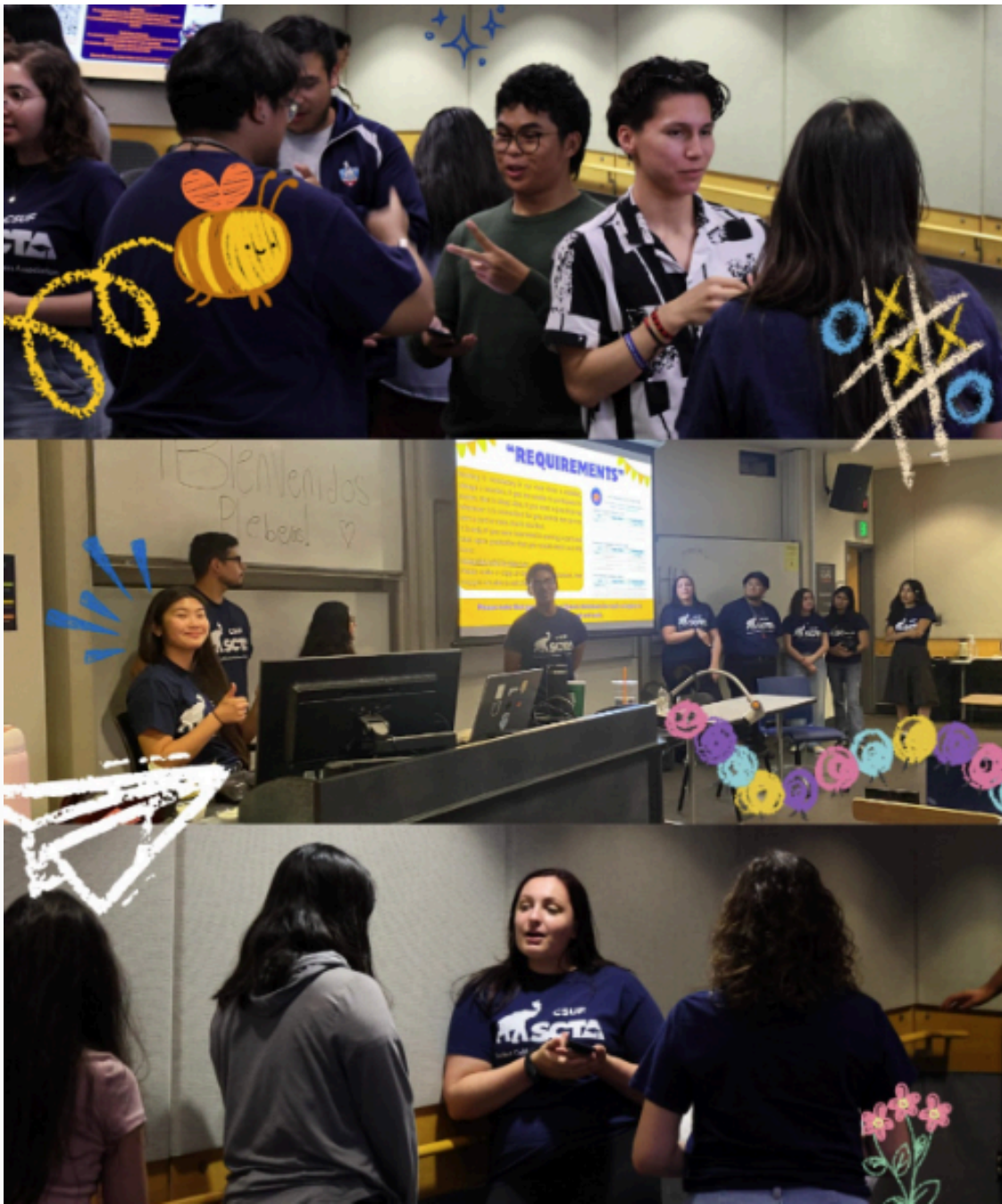
San Diego State University